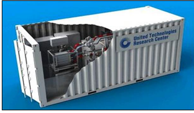
Figure 7: Flow battery storage container

Eskom is proposing two layout alternatives: