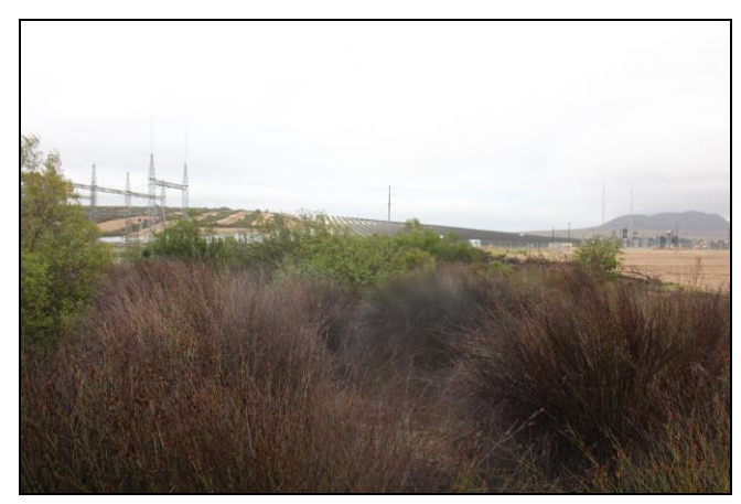
Figure 4: Strip of natural vegetation adjacent to the Substation