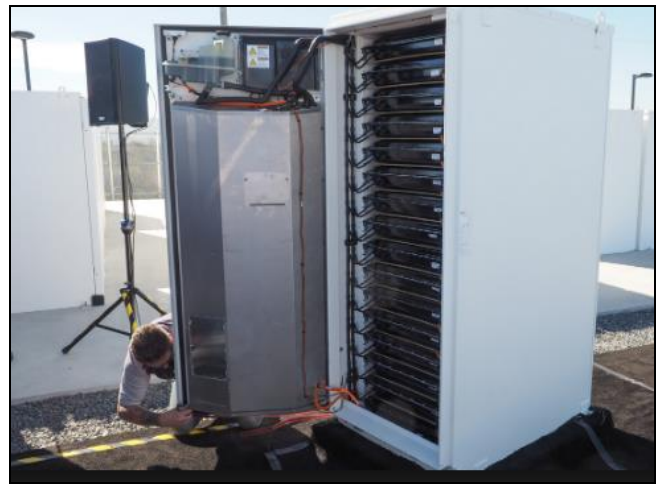
Figure 6: Solid state battery module