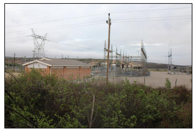
Figure 3: The Paleisheuwel Substation

site (Amaryllidaceae spp., Apocynaceae spp., Mesembryanthemaceae spp. and Proteaceae spp.).